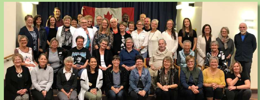
2019 Volunteer Appreciation Evening

Nine years later, your partnership fuels the Hospice Society of Camrose & District in its work providing support to those with a life-limiting illness, support for their families, and for those who grieve a loss. From compassionate bedside care to grief support, our donors, staff, and trained volunteers endeavor to enhance quality of life. We are hospice!