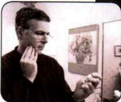
Take pain medication for discomfort