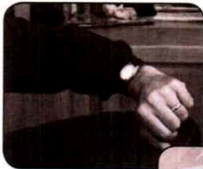
Do not chew for 30 minutes

It is not a problem for a small portion of a temporary filling to wear away or break off, but if the entire filling wears out, or if a temporary crown comes off, call us so that it can be replaced.