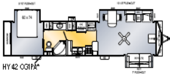
HY 42 OG1PA*