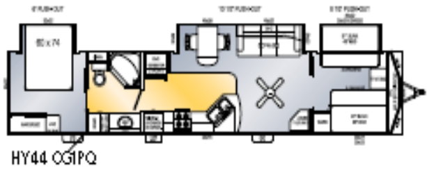
HY 44 OG1PQ