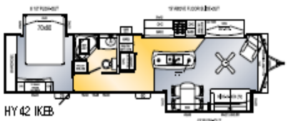
HY 42 IKEB