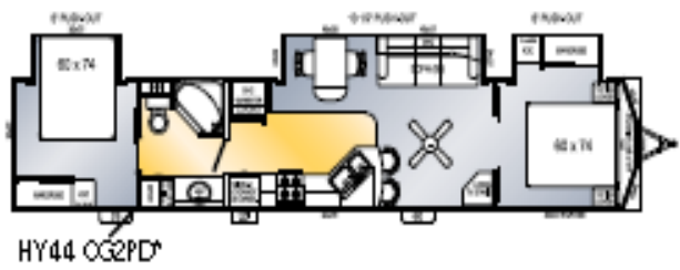
HY 44 OG2PD*