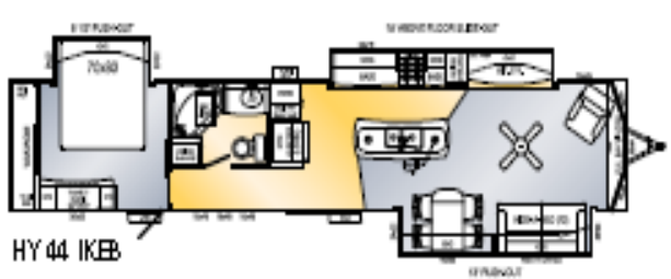
HY 44 IKEB