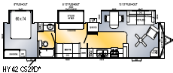
HY 42 OS2PD*