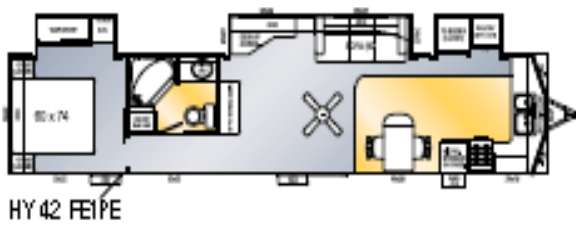
HY 42 FE1PE