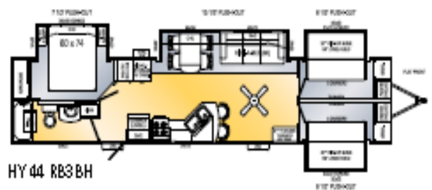
HY 44 RB3BH