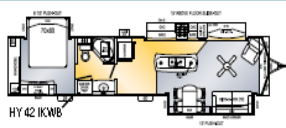
HY 42 IKWB