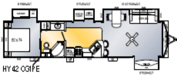
HY 42 OG1PE