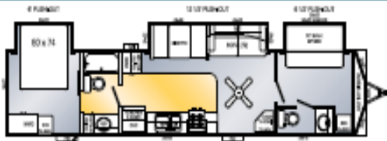
HY 39 SPEC 54