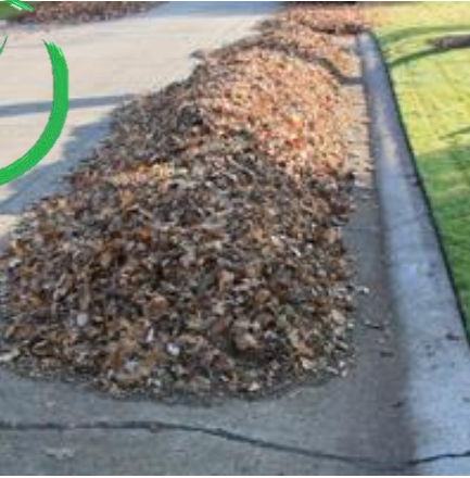
DO rake into long, narrow rows.