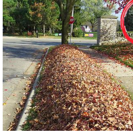
DON'T place leaves on the terrace.