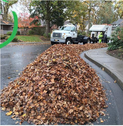
DO place leaves in the gutter.