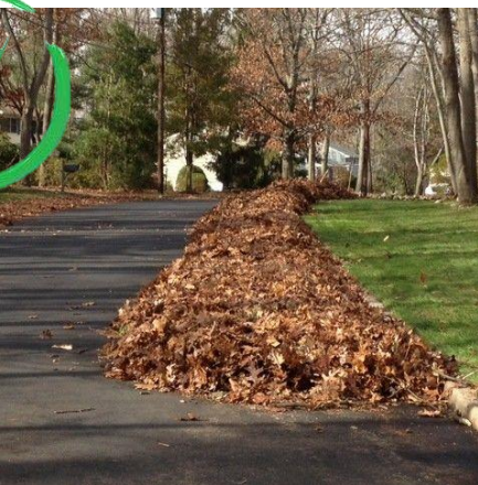
DO include leaves and light mulches.