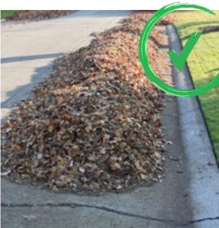
DO rake into long, narrow rows.