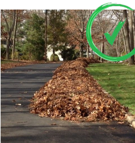
DO include leaves and light mulches.