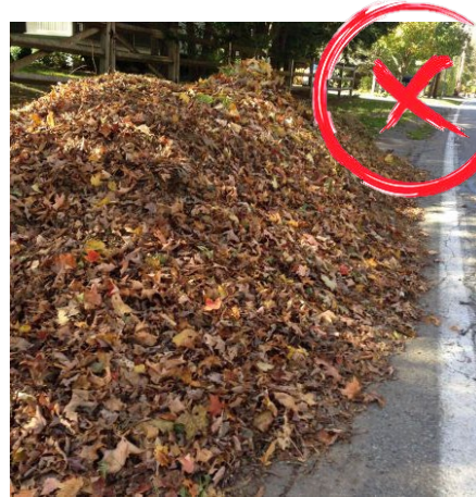
DON'T rake into large, compact piles.