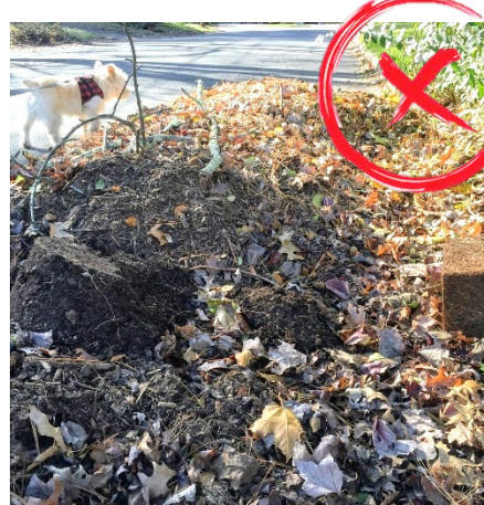
DON'T include sticks, grass clippings, etc.*

Leaf collection is tentatively scheduled from October 7th, to December 1st, 2024. This time frame is heavily dependent on weather and subject to change. Please follow the City of Kiel on Facebook for more information and potential schedule changes.