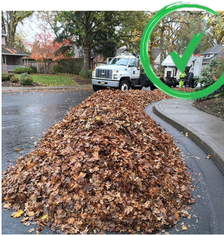
DO place leaves in the gutter.