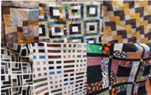
A sampling of quilts for the Oregon Youth Authority.

Tillamook County Quilt Guild has had a busy year. Yearly we donate quilts to Oregon Youth Authority and this year we were able to finish 8 quilts to give them. We will finish out the year with our Christmas party and block exchange. We welcome anyone to join our group. We meet at Latimer on the third Thursday of the month at 10:30.