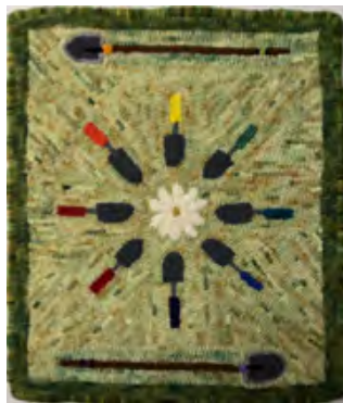
The 10 of spades, a hookers interpretation by Candy Allen

Over the summer Latimer members drew cards from a standard deck of 52, and then created their own interpretations. The rules were simple: any medium was allowed, and the maximum size allowed was 18 x 24 inches. The interpretations include weavings, embroidery, paintings, quilts, tapestries, and other inventive ideas.