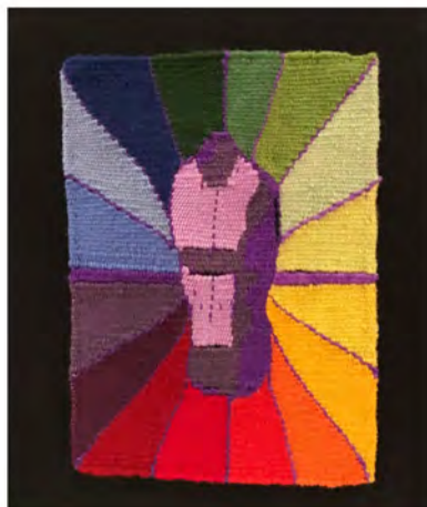
Lee's tapestry interpretation of a dress form.