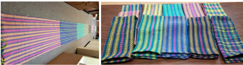
Tamara and Sofie wove thirteen beautiful towels on a single warp.