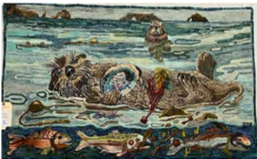
Beautiful pictorial hooked item of sea otters.