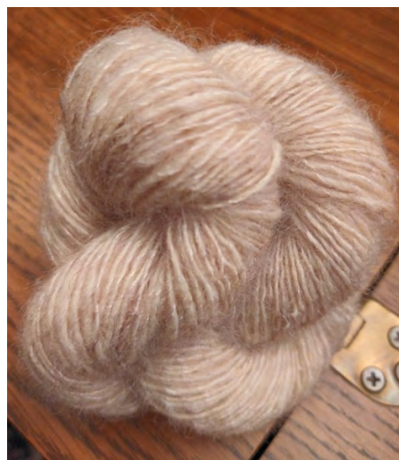
Core-spun Eider wool over mohair/silk