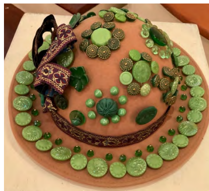
Czech Green Glass