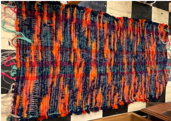
Stephanie's rug, woven in just a few days!

We also have many works in progress including a cotton table runner, linen towels, wool blankets, and a summer-weight scarf. You can see all of these beautiful projects in progress anytime and our weavers in action on Tuesdays and Fridays.