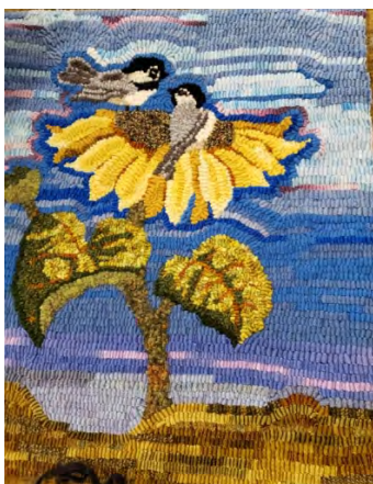
A beautiful piece by Lona Slivkoff