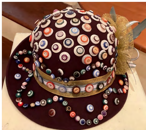
China Inkwells and Bulls eyes