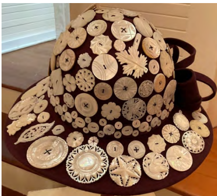
Carved Mother of Pearl