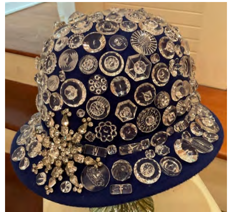
Clear Cut Crystall and Glass