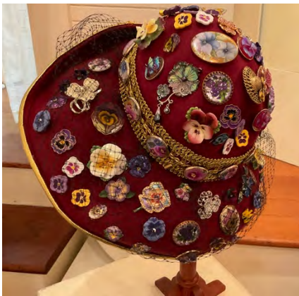
Pansy Buttons and Brooches