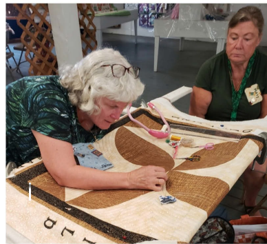
Hand quilting at the fair