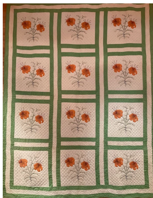
“Tiger Lily”, machine appliqued and hand quilted, circa 1950