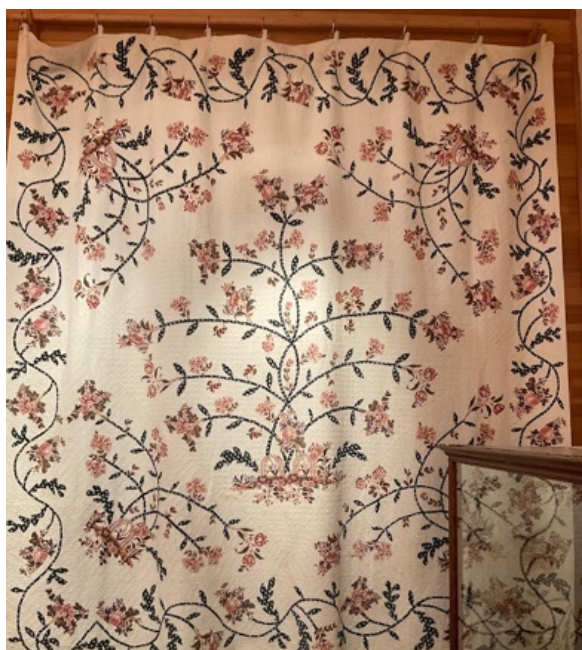
“Tree of Life Summer Quilt”, came across the plains, circa 1853