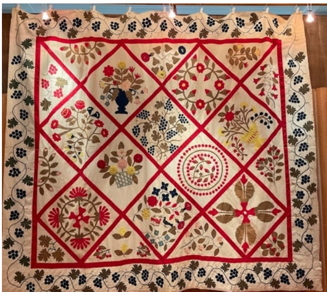
Victoria Baltimore Quilt, hand appliqued, circa 1845

The joint exhibit with the Latimer and the Tillamook County Pioneer museum displayed an interesting collection of historic quilts, many from the 19 th Century.