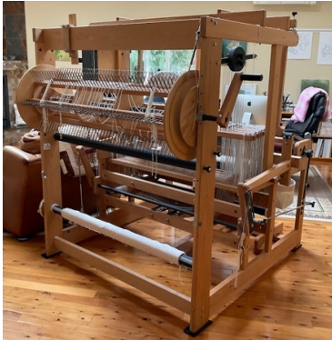
The new production loom

Right now in the weaving room you can see a number of diverse and beautiful weavings in progress. There are placemats made of recycled cotton t-shirts, a couple of unique cotton hand towels in bright colors, a tapestry and a deflected doubleweave scarf in fine merino/silk yarn. We also have a couple different examples of krokragd weaving in both cotton and indigo-dyed wool, and at least two looms in the process of getting dressed.