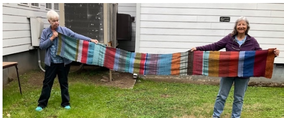
The community loom weaving

Cordelia's Knitters have been busy knitting pocketbook slippers. These slippers take their name from the pocketbook's they resemble. When you put them on your foot, they transform into a Mary Jane shape. The pattern says they are one size fits all, but given our various yarn weights, needle sizes and gauge variations, we have slippers to fit almost anyone. These slippers will be for sale at Latimer as long as supplies last.