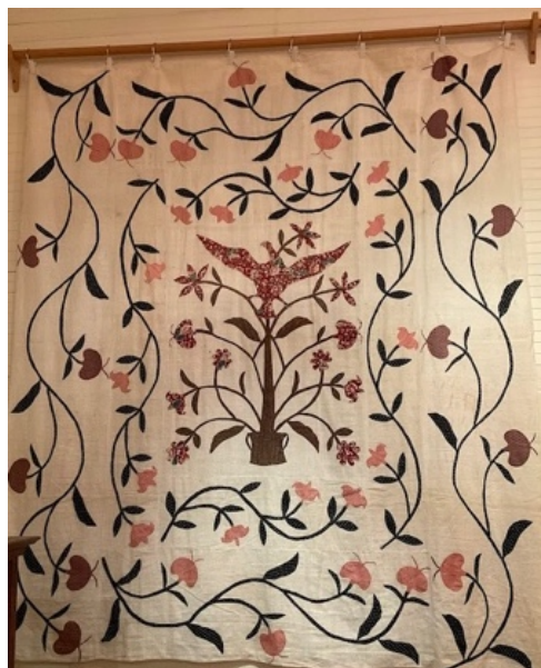
Broderie Parse, hand appliqued, circa 1840