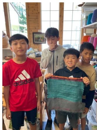
Young family of weavers