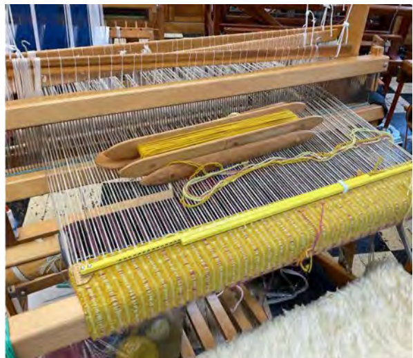
The Krökbragd wool rug