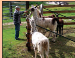
A peaceful getaway!

Hunters: Pheasant & turkey season packages available