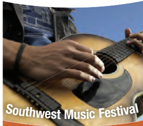
Southwest Music Festival JULY 30