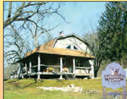
Guest cabins with fireplaces & whirlpool tubs.