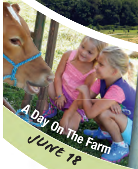
A Day On The Farm JUNE 18