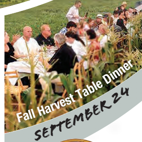
Fall Harvest Table Dinner SEPTEMBER 24