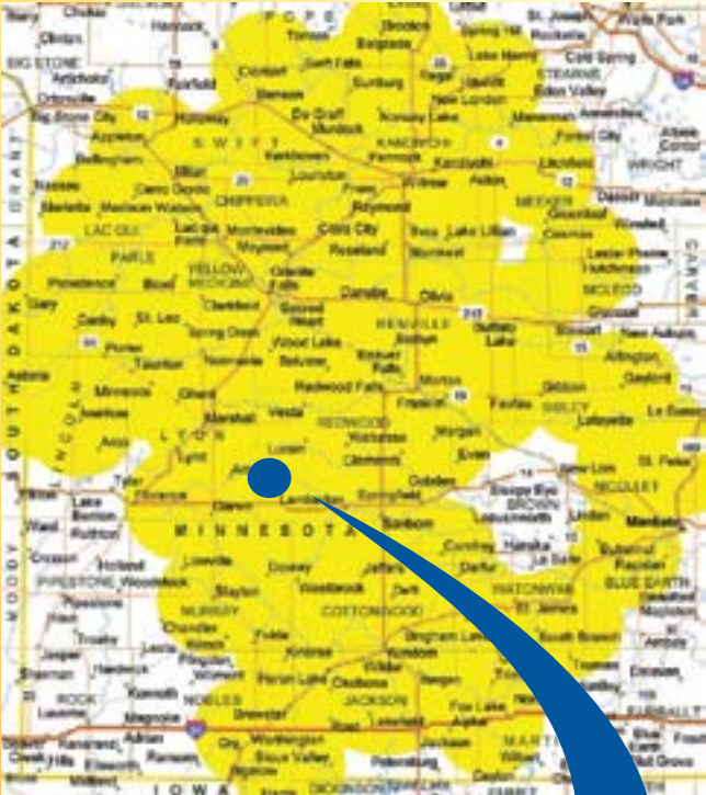
Our general coverage map

As a local non-profit, member-owned cooperative, MVTV Wireless is able to bring you dependable, affordable and fast internet service with no contracts, no limits, no hidden fees and simply better customer service!