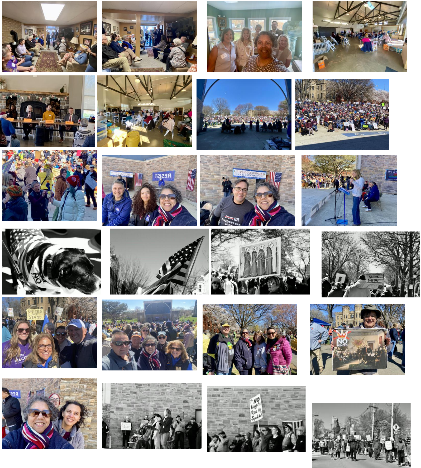
Black & white images are random photos.