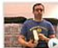
Time Thugs The Tenderloins

Books Comedy Jobs NEW! MySpaceIM Blogs Filmmakers Movies Schools ChatRooms Games Music TV On Demand NEW! Classifieds Horoscopes Music Videos Videos