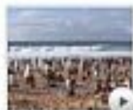
2006 Pipeline Masters Joe