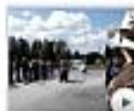
Motorbike crash Jack