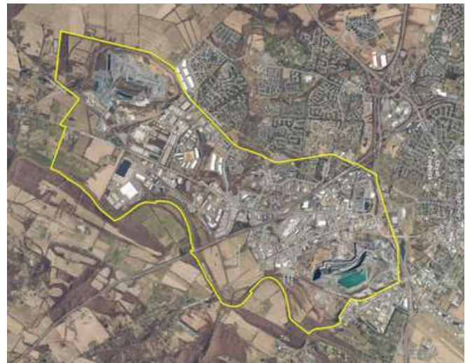
Boundary lines: New Design Road to below Metro Landscape & Construction to Monocacy River to Reichs Ford Road to I-70 back to New Design Road.