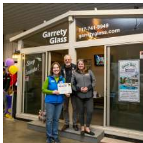
Top Row, Shown from Left to Right: Winner of Best Booth in Building 9, Casey Fence & Deck Winner of Best Booth in Building 12, Strat Security Winner of Best Booth in Building 13, Outdoor Solutions, LLC Bottom Row, Shown from Left to Right: Winner of Best Booth in Building 14, Classic Home Advisors Winner of Best Booth in Building 14A, Bartz Landscaping Winner of Best Booth in Show, Garrety Glass